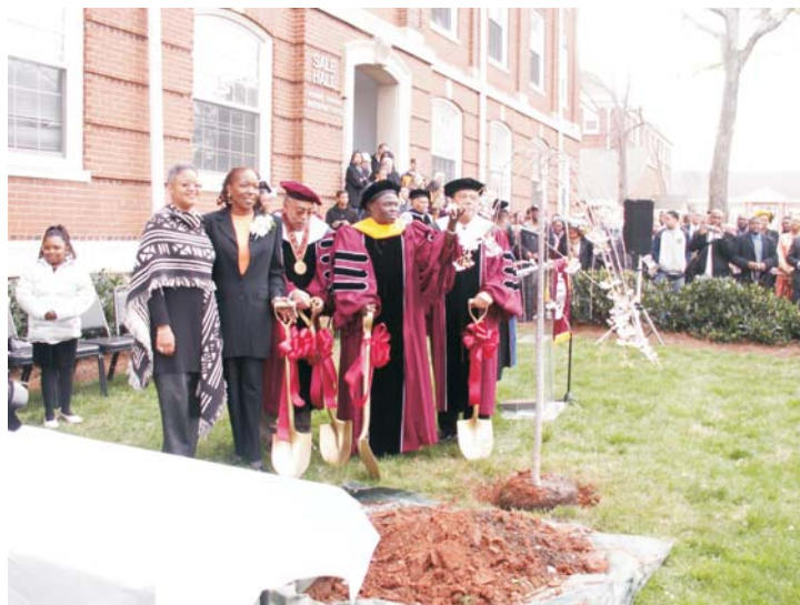
Wangari Maathai, a 2004 Nobel Prize Receptient, touching the flower of a willow planted after a Special Convocation at Morehouse College on March 24, 2006.