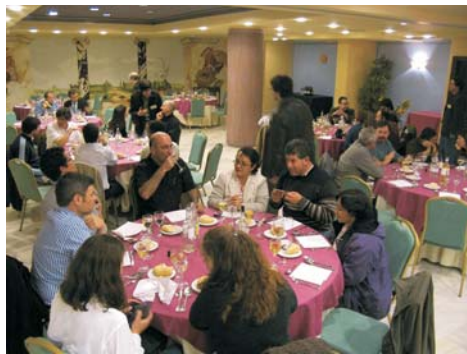
Conference attendees at supper in the conference hotel, Carmona, Spain.

Delegates attending and presenting papers came from a wide variety of countries: Spain, Austria, Italy, Puerto Rico, Cuba, Trinidad and Tobago, Chile, Argentina, Brazil, Ecuador, Venezuela, Colombia, Costa Rica, Honduras, Mexico, the United States, and Canada. Many of the sessions dealt with issues